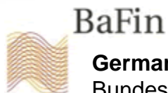
Germany Bundesanstalt für Finanzdienstleistungsaufsicht